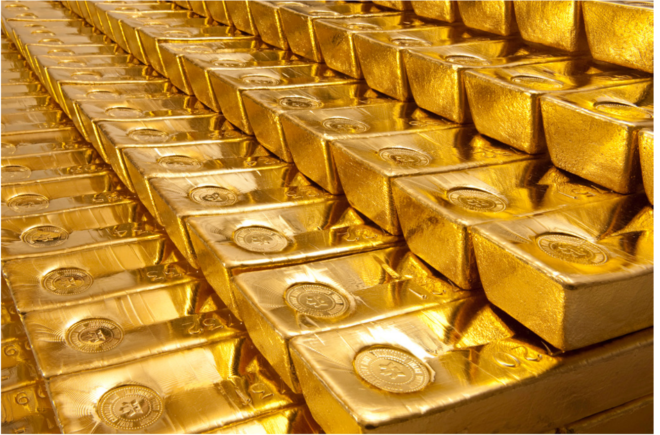
London Good Delivery Bars