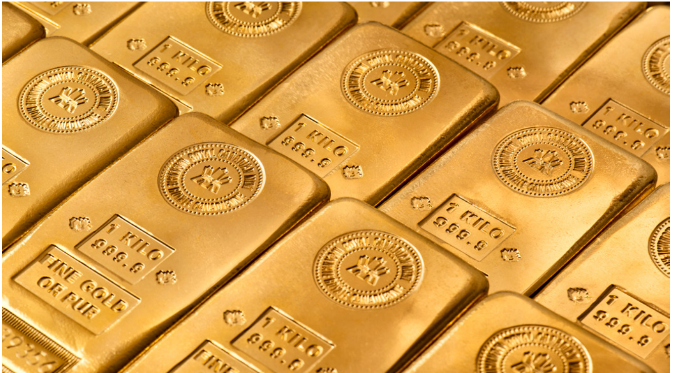
Royal Canadian Mint 1 kilo gold bars