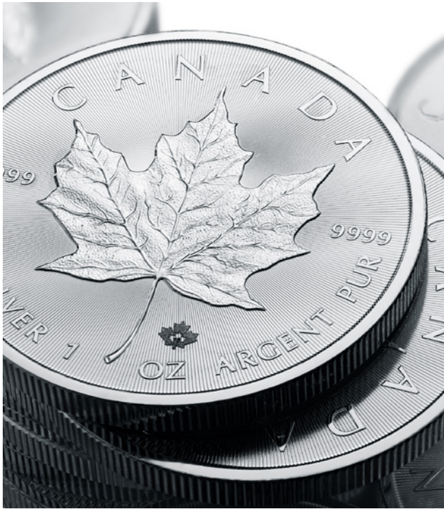
Silver Maple Leaf (SML) bullion coins