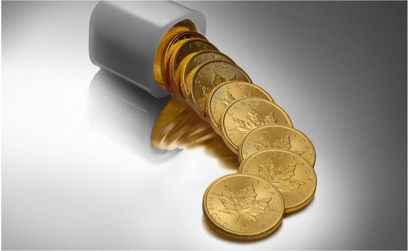
Gold Maple Leaf (GML) bullion coins