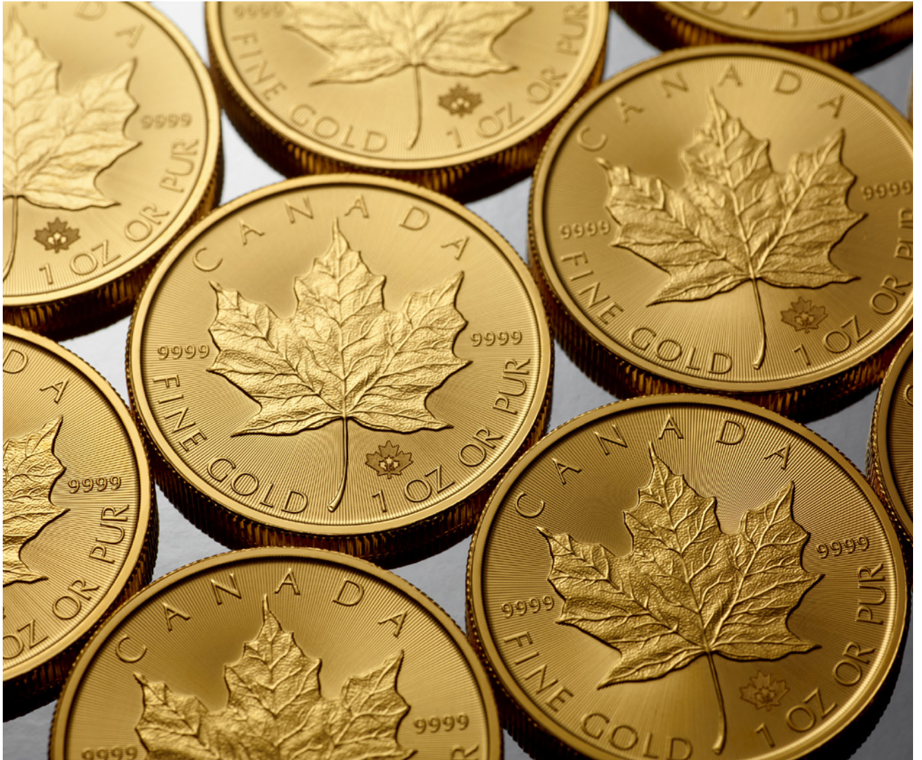
Gold Maple Leaf (GML) bullion coins