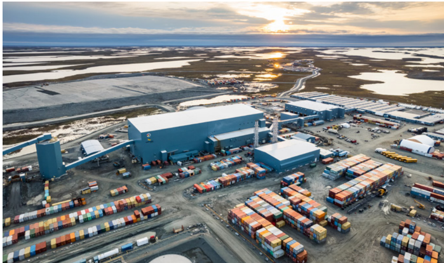
Agnico Eagle's Meliadine mine

The Royal Canadian Mint is an accredited LBMA Good Delivery refiner, agreeing to a set of obligations and standards on how we source precious metals from suppliers and customers.